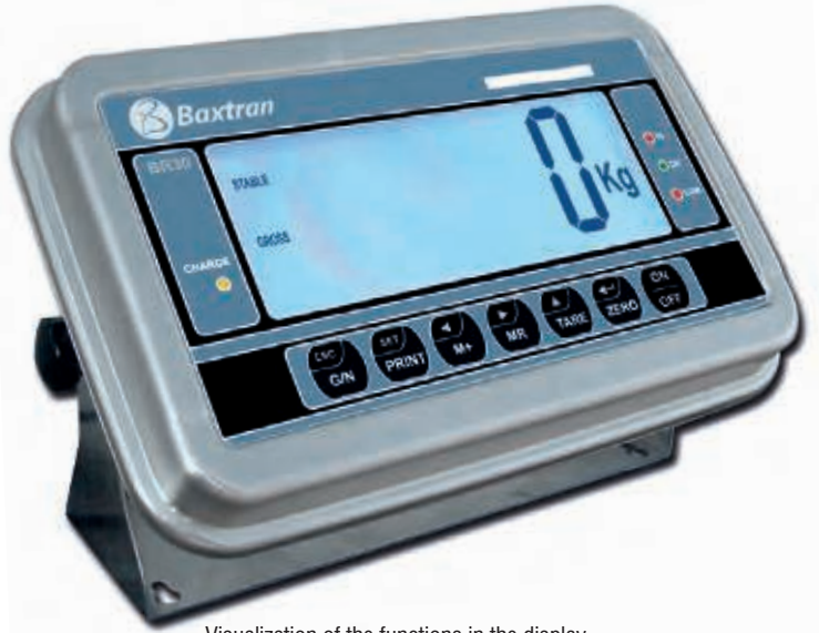
Visualization of the functions in the display